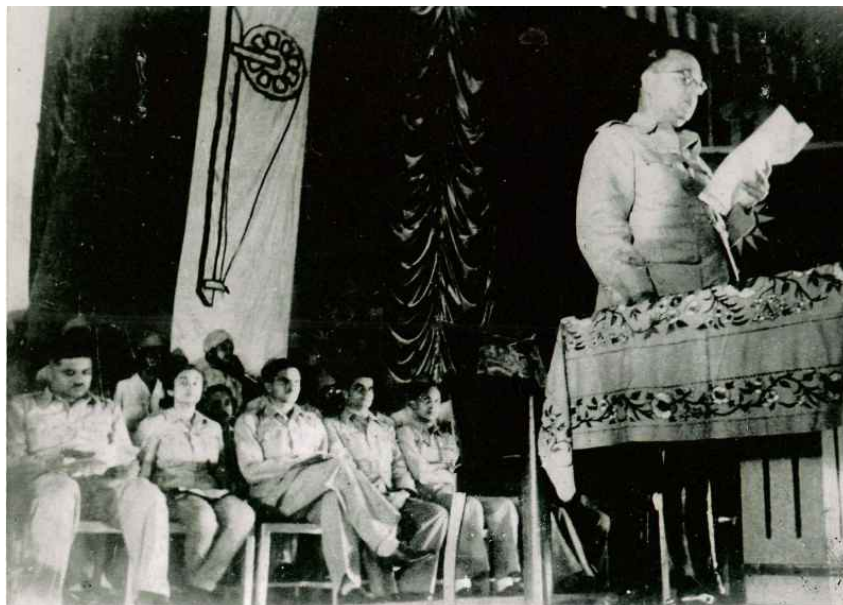
Subhash Chandra Bose proclaims the Provisional Government of Azad Hind

Having been constituted as the Provisional Government of Azad Hind by the Indian Independence League in East Asia, we enter upon our duties with a full sense of the responsibility that has devolved on us. And we hereby pledge our lives and of our comrades-in-arms to the cause of the