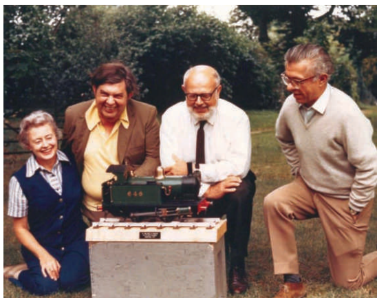
E. Margaret Burbidge, Geoffrey Burbidge, William A. Fowler and Fred Hoyle with the steam train presented to William Fowler in July 1971 at the conference on massive objects organised in honour of his 60th birthday.

This integration of theory and experiment was a hallmark of his approach and a key reason for the enduring success of the B 2 FH framework. It described the processes responsible for creating many elements, including those essential to life, such as carbon, oxygen and iron.