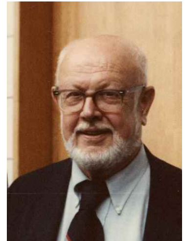
William Alfred Fowler

He pursued his education at Ohio State University. In 1936, he earned his PhD in nuclear physics from the California Institute of Technology (Caltech) in Pasadena, California. He was elected to the United States National Academy of Sciences in 1938. In 1939, Fowler became an assistant professor at Caltech. It was at Caltech that Fowler spent most of his distinguished career, ultimately becoming one of the leading figures in astrophysics during the 20th century.