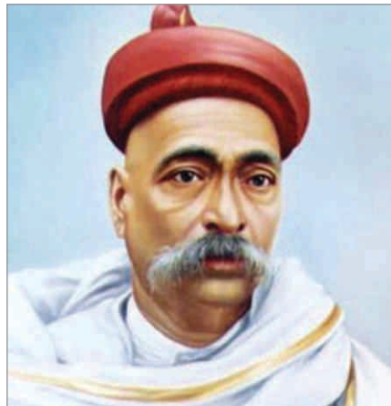
Bal Gangadhar Tilak

English education, growing poverty and better familiarity with our rulers, opened our eyes and our leaders; especially the venerable leader who presided over the recent Congress session was the first to tell us that the drain from the country was ruining it, and if the drain was to continue, there was some great disaster awaiting us.