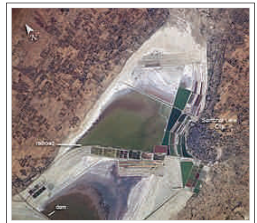
Aerial view of the Sambhar Lake