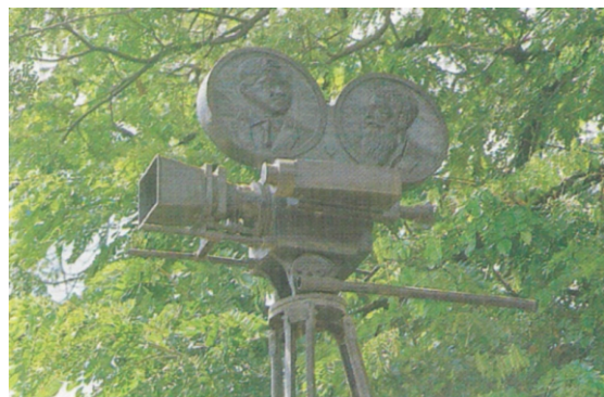
The sculpture of a movie camera made in memory of his father is a landmark to their house

In his lifetime he produced paintings and sculptures in what was popularly known as the realistic style. He never signed his paintings since he believed that an artist should be known by his work and not by his signature. This gifted son of a gifted father died in 1995.