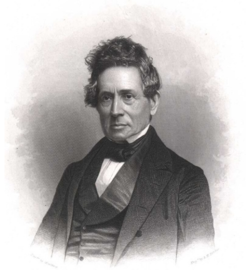
Prof. Denison Olmsted

On that night, Prof Olmsted observed that the meteors seemed to be originating from a certain point in the Leo constellation. He decided to carry out further research on this spectacular phenomenon. He visited nearby towns to talk to people and to record their impressions and was told that a similar spectacle was witnessed by people in other places too. The estimate was that, in just one hour, numerous meteors were seen.