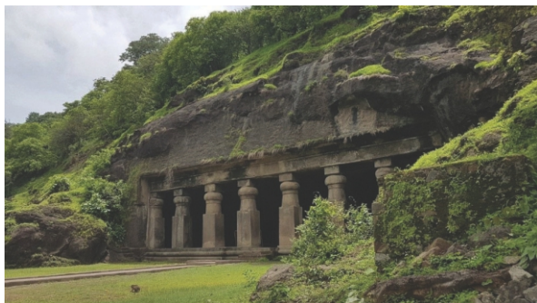
Entrance to Cave No. 1

The earliest attempts to prevent further damage to the Caves were started by British India officials in 1909. The monuments were restored in the 1970s and were added to UNESCO's World Heritage sites in 1987.