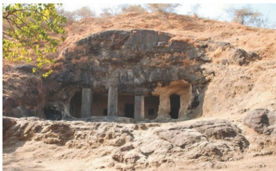
Cave No. 6