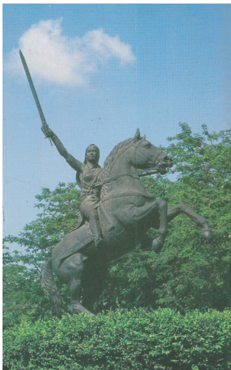
Statue of Maharani Tarabai at Panhala