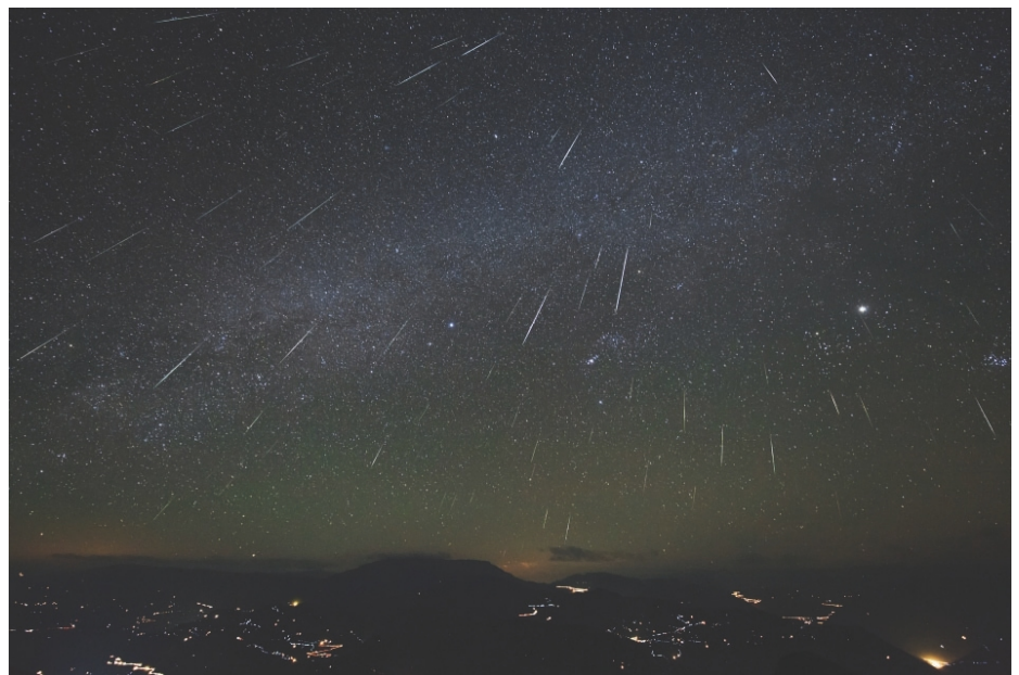
Long exposure photograph of Geminid meteor shower taken on December 12, 2016.

Every year Halley's comet produces two meteor showers - Eta Aquarids, which appear on May 5/6 and Orionids which appear on October 20/21. Geminids is one of the finest meteor showers as up to 75 meteors per hour can be observed in the sky. This shower shows a