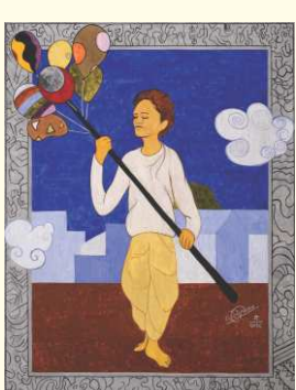
Painting by Siddhant Pisal