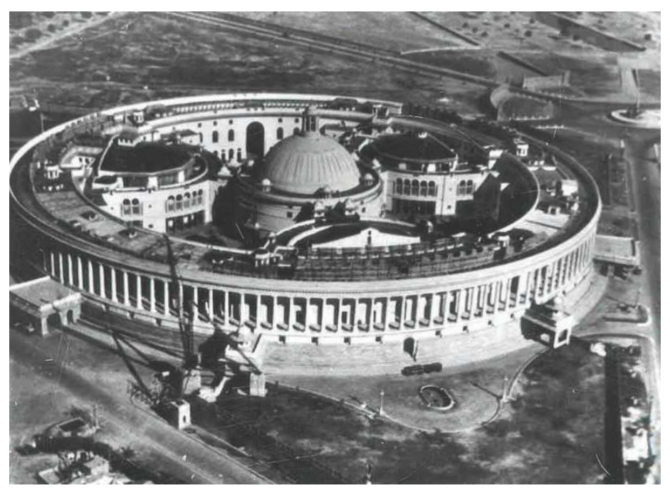
Archival aerial view of Parliament House Complex

Provincial Legislatures were unicameral known as Legislative Councils. Seventy per cent of the members were to be elected and twenty per cent were nominated