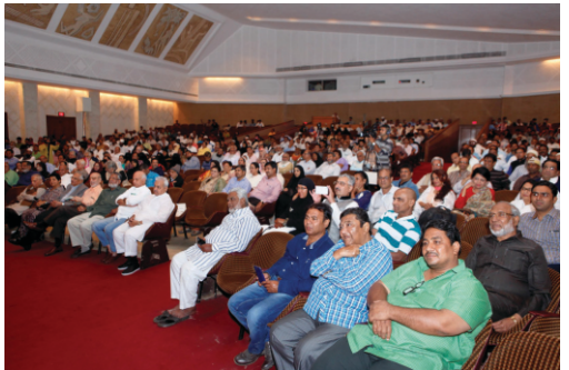
Lovers of Urdu poetry had gathered in large number to enjoy the Mushaira